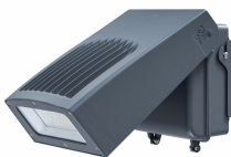
UNI WALL MOUNT