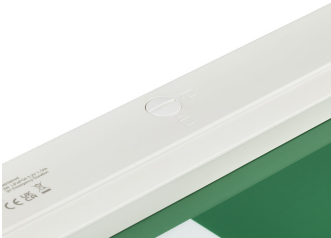
Emergency Exit Sign EM159C DET02