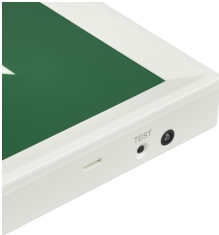
Emergency Slim Exit Sign EM155C DET02