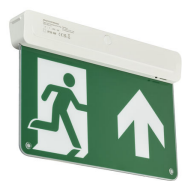
Emergency Exit Sign EM159C SPP01