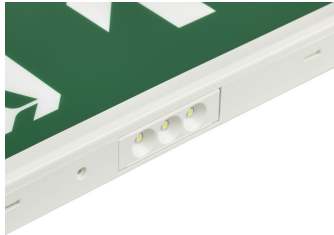
Emergency Slim Exit Sign EM155C DET01