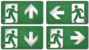
Emergency Exit Sign all legends