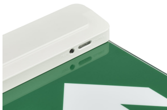
Emergency Exit Sign EM159C DET01