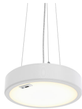
Essential Suspended RTP