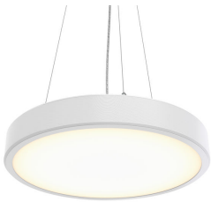
Essential Suspended RTP