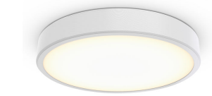
Essential Surface RTP