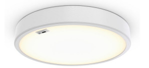
Essential Surface RTP