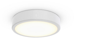
Essential Surface RTP