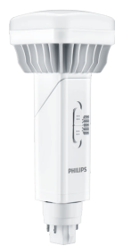
Product standard image