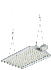
GentleSpace gen4-large, suspension, Interact ready