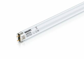
Essential BL TL/TL-D