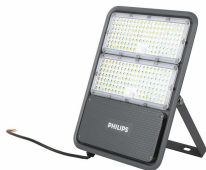
Smart Bright Essential Pro