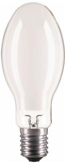
LPPR SON E40 E39