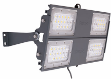
FlowMax - Tunnel Lighting