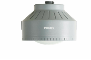
Essential SmartBright LED Standard Product Photo