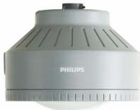
Essential SmartBright LED Standard Product Photo