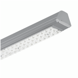
Maxos LED Industry