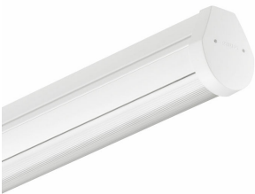
IPPR 4MX900i 0001