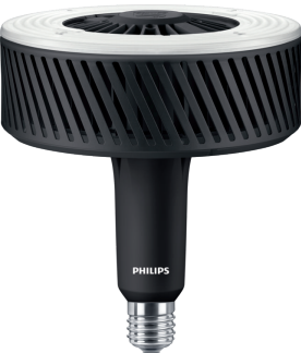
LEDTForce HPI Others E40