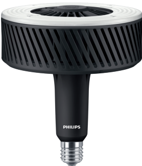
LEDTForce HPI Others E40