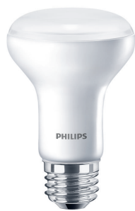
LEDbulb, R20 E26