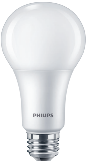
LEDbulb A21 E26 FR