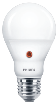
LEDbulbD2D A19 E27 FR