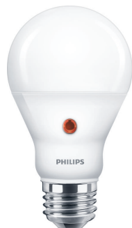
LEDbulb E27 A19