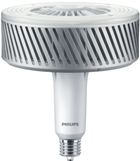
LEDTForce Others EX39