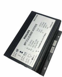
ComboCC Gen 4.0