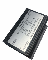
ComboCC Gen 4.0 Hybrid Supply Unit