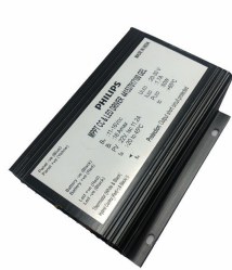
ComboCC Gen 4.0