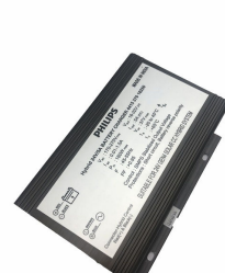
ComboCC Gen 4.0 Hybrid Supply Unit