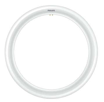
LED Circular 840 G10q AP