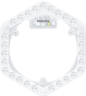
LEDtube MOD GMGC 20W Circular