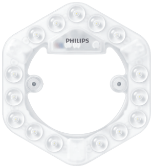
LEDtube MOD GMGC 10W Circular