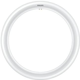
LED Circular 840 G10q AP