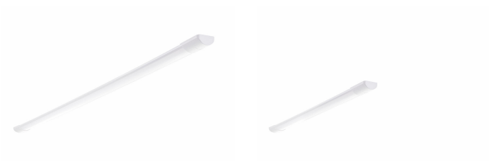
BN005 L1200 STD