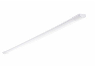
BN005 L1200 STD