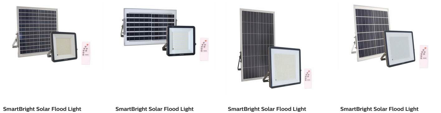
SmartBright Solar Flood Light