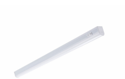
Smartbright T8 Batten