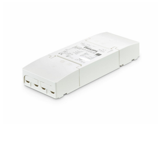
Xitanium WH DALI