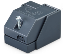
Strain Relief Block