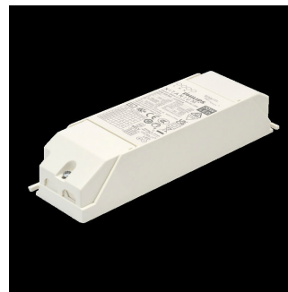
Mini Dipswitch Independent