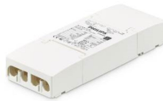
Xitanium WH driver