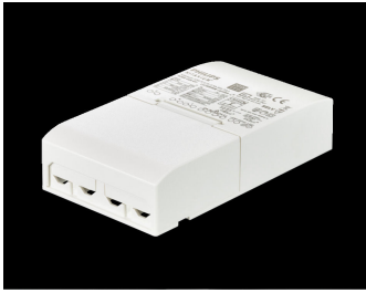
Xitanium R DALI