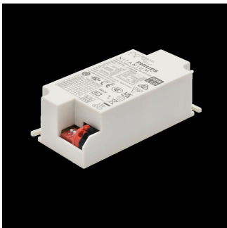
Mini Dipswitch Built in