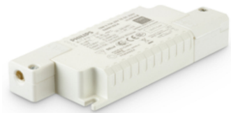
Xitanium TE SC driver