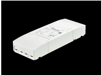
Xitanim WH SR