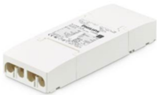
Xitanium WH driver