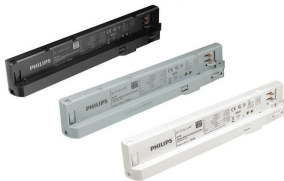
Xitanium Track MasterConnect