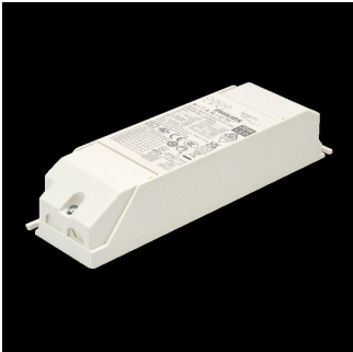
Mini Dipswitch Independent