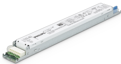
Xitanium 90W 0.15-0.5A 220V TD21 S