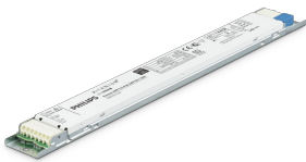
TD11 HR images