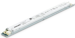
Xitanium LED linear drivers - Non - Isolated family