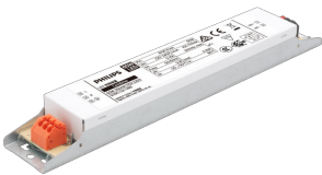
CertaDrive 60W 350mA