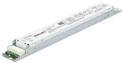
Xitanium non-isolated DALI driver