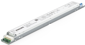
Xitanium non-iso 100W+150W iXt TD