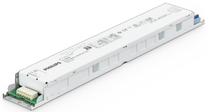
Xitanium 300W iXt TD