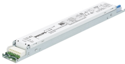
Xitanium non-isolated DALI driver