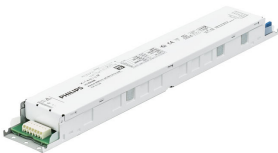
Xitanium non-isolated DALI industry driver