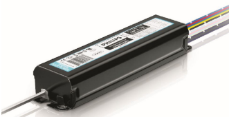
Xitanium Prog 75 and 150W