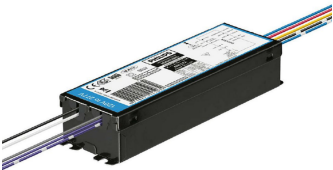
Xitanium Prog 40W