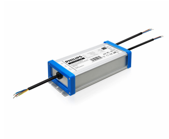
9290014040 cable version IP67 250W