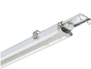
Pacific LED gen5 with push in 7-pole (PI7) connector