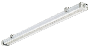
Pacific LED gen5, L1200