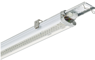
Pacific LED gen5 with push in 7-pole (PI7) connector