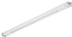
Pacific LED gen5,, L1600