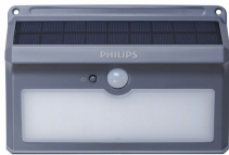
Essential SmartBright Solar Wall Light