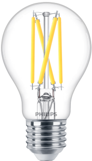
LEDclassic 60W A60 E27 CL WGD90 SRT4 1