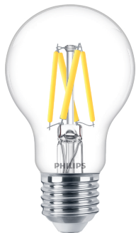
LEDclassic 40W A60 E27 CL WGD90 SRT4 1