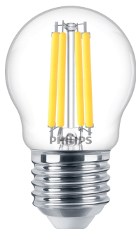
LEDlustre MAS P45 E27 CL