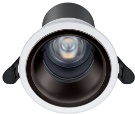
RS350 G2 RC Rd D75 1H GC