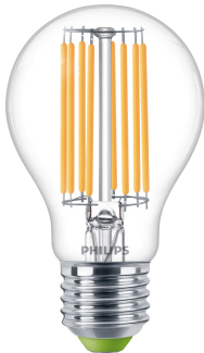
LEDbulb MAS EU A60 E27 CL 3