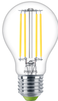
LEDbulb MAS EU A60 E27 CL 2