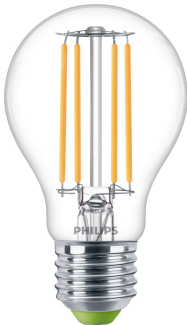
LEDbulb MAS EU A60 E27 CL 1