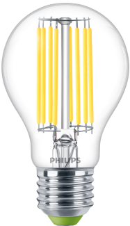
LEDbulb MAS EU A60 E27 CL 4