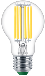
LED CLA 75W A60 E27 4000K CL UE SRT4