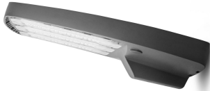
Skyline eWay Street BRP370