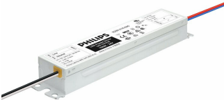
Power Driver 100W