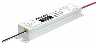
Power Driver 20W