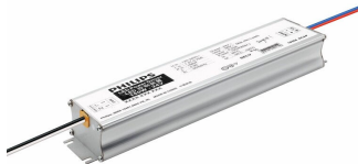
Power Driver 150W