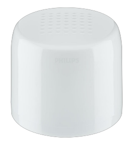
Product Photo LLC7813