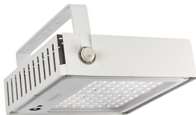
Mini300_gen3- BBP333_RM_with_accessory_kit- DPP.TIF